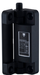
Top axial output M12 Connector

assured by inserting the appropriate safety plug (not removable) in the adjustment hole.