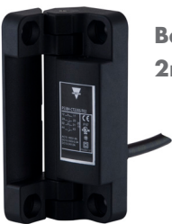
Back output 2mt. Cable