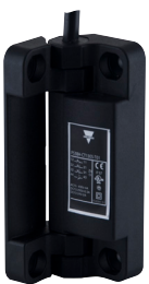
Top axial output 2mt. Cable